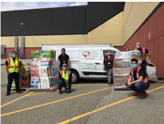
Seniors Services Society of BC onsite at Amazon